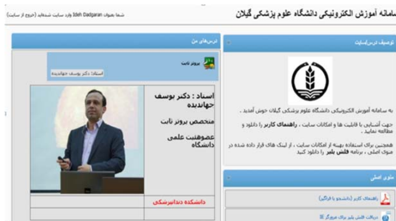
Fig. 1. Sample of instructional content uploaded on LMS

lesson subjects and simultaneously, the slide demonstration together with the teacher's sound and image were presented (Figs. 1-3). Content output in Sharable Content Object Reference Model (SCORM) format was saved to make Learning Management System (LMS) load- ing possible. SCORM is a standard for edu-